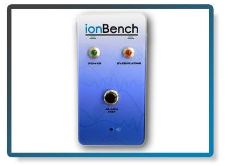
Overheating temperature alarm

Noise reduction cabinet integrates an audible & visual (red LED) overheating temperature alarm (on battery backup) for an increased vacuum pump lifetime.