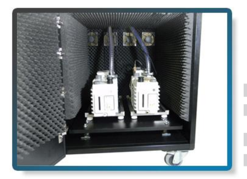
Noise enclosure for vacuum pumps