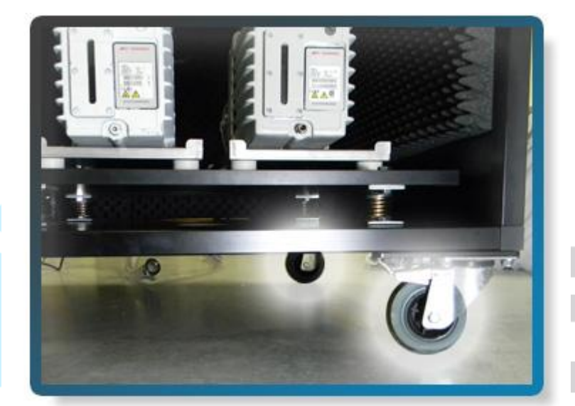
Fully movable bench

Fully movable bench with a weight capacity above 440 kg / 970 Ibs and Chemical resistant worksurface for laboratory applications. Different bench sizes available depending the configuration of the LC/GC/MS. Black steel powder coated frame.