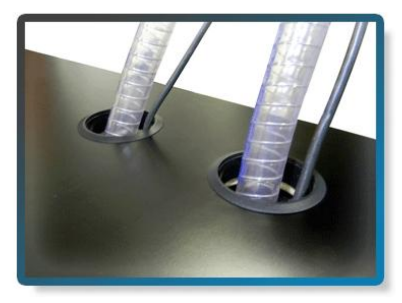
Pipe and cable management