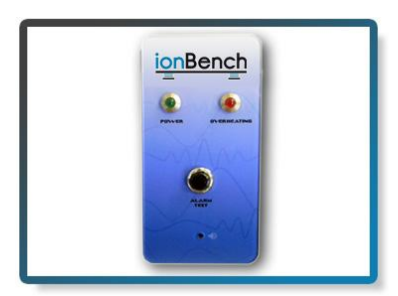
Overheating temperature alarm