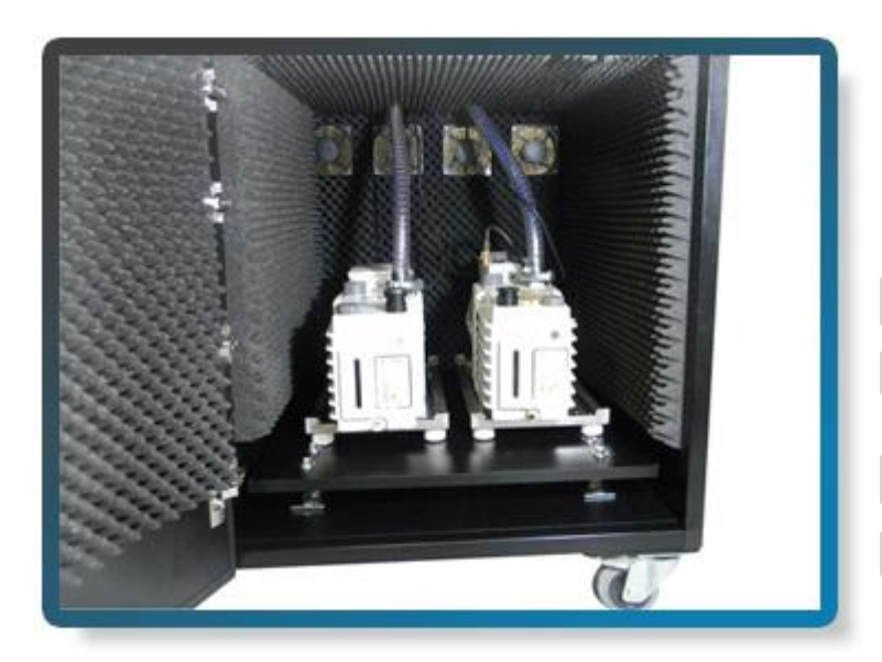
Noise enclosure for vacuum pumps