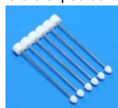
MT Holder X5

This kit allows the steps from sampling to extraction (during head space analysis) to be taken without requiring direct touch of the materials with hands. The use of this kit is therefore expected to reduce contamination and to improve reproducibility of analysis.