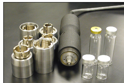
Interchangeable jaw sets allow use with all 11 mm and 20 mm crimp caps and seals.