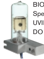
BIO-TEK Kontron Spectrophotometer UVIKON 9XX DO 905 TJ