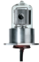
TSP HPLC Detector UV 6000 DS 252/05 J