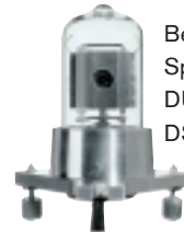
Beckman Spectrophotometer DU 650/7000 DS 246/05 J